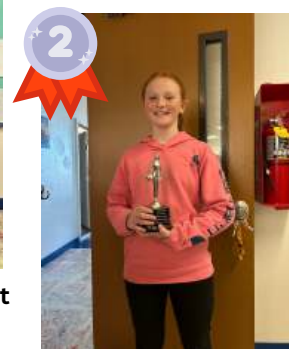
2nd Place at the district level