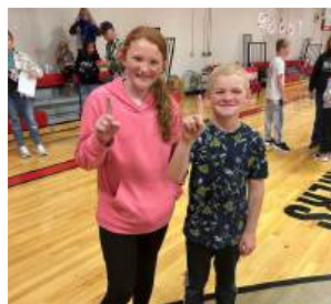
1st Place at the local level