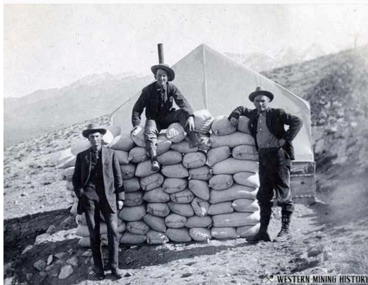
Miners pose with sacked high-grade gold ore at Round Mountain, Nevada ca. 1910.

https://en.wikipedia.org/wiki/Round_Mountain,_Nevada#:~:text=Gold%20was%20discovered%20at%20Round,population%20was%20close%20to%20400.