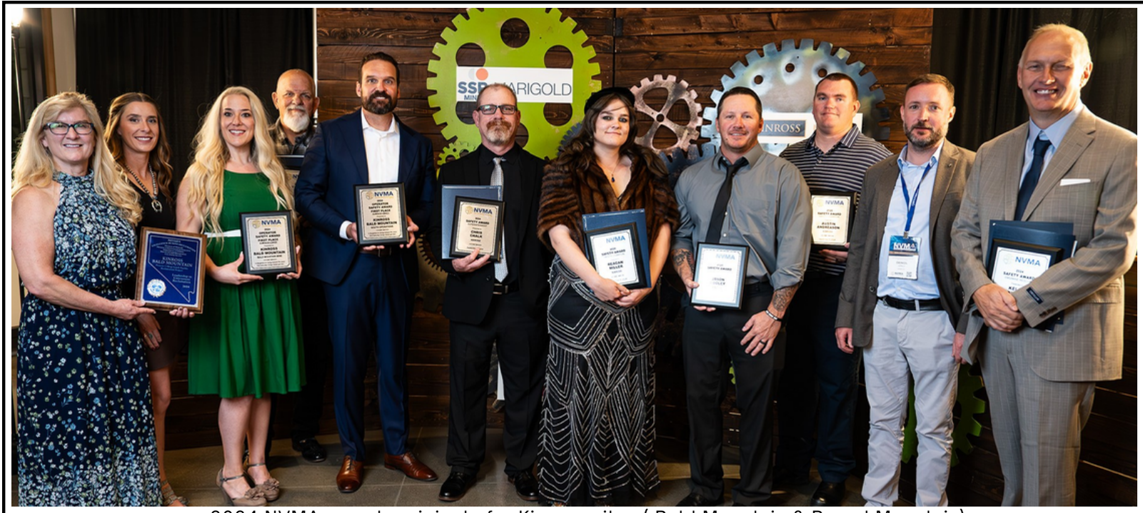
2024 NVMA award recipients for Kinross sites (Bald Mountain & Round Mountain)

The 111th, Annual Nevada Mining Association Convention and Safety Awards Banquet proved to be another successful event for Nevada Mining.