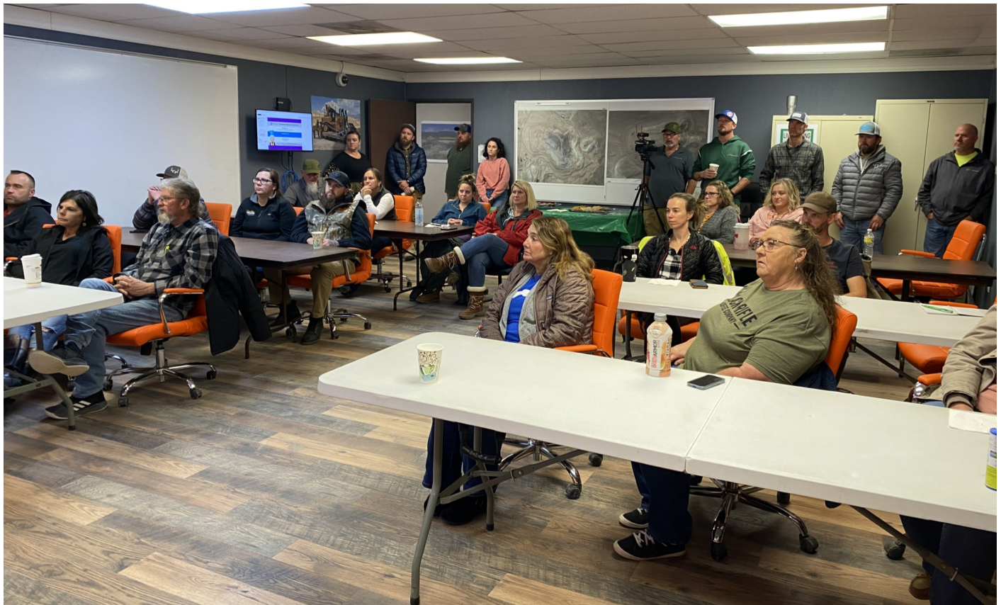
The group of a couple dozen interested community members attended the Town Hall on November 17, held in the newly renovated Safety Building.