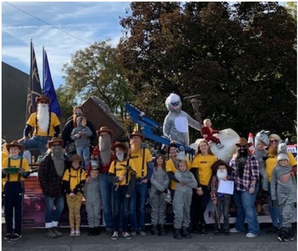
For the first time in the history of the Carson City Nevada Day Parade, mining families represented Nevada mining on a Kinross Nevada float that a team of RMGC people designed and built. Read more on pages 2-4.