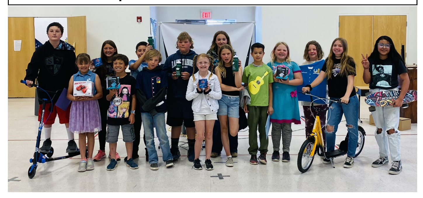
Students at Round Mountain Elementary School were provided with items for a raffle of rewards by Kinross Round Mountain. The students were given a raffle ticket for their efforts during state testing in April. Thank you to RMGC for the support!