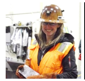
"Say yes to opportunities, be uncomfortable, be adventurous. Your style of leadership can be your own; don't try to be someone you aren't. At any level you can take control of how you respond to situations and how you treat others." ~Kat