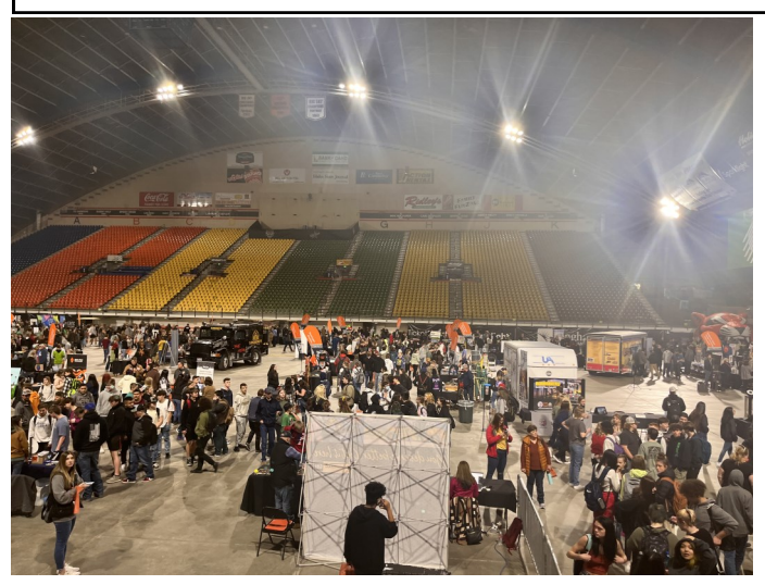
Over 3,000 high school students attended the Idaho State University's Tech Expo.