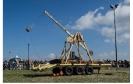
Examples of punkin' chunkin' devices.