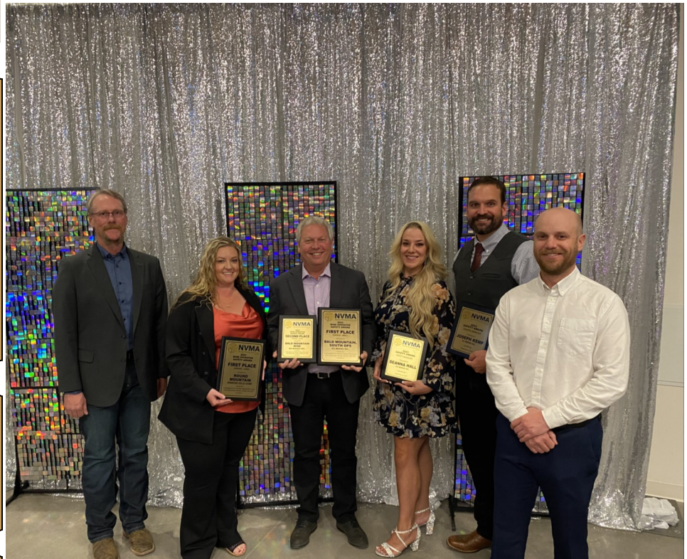
Both Bald Mountain and Round Mountain walked away with several safety awards during the 2023 Nevada Mining Association's Annual Convention and Safety Awards Banquet. Pictured above are some of the sites' attendees. Read more on pages 2 and 3.