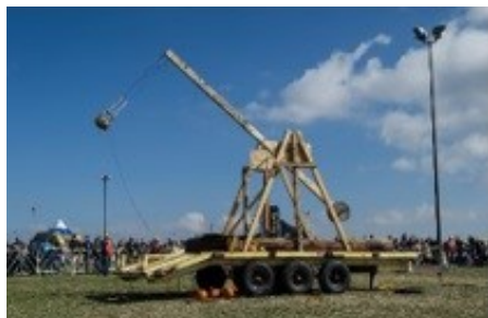
Examples of punkin' chunkin' devices.